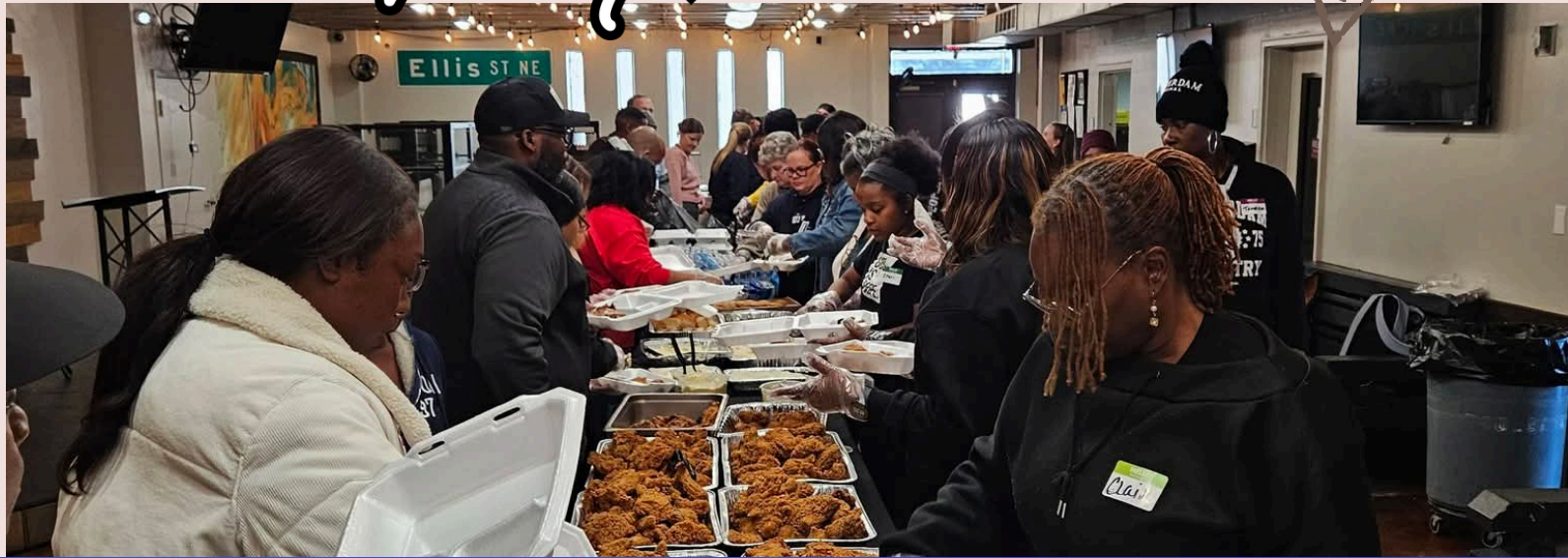
Volunteers preparing our nightly impact meals for our friends.